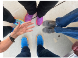
The Service Project Magician