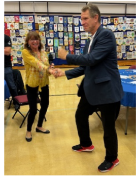
Dancing in the Gym