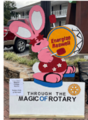
After Hours Club Roswell Rotary Club