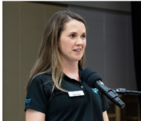
Great presentation on Parkinson's