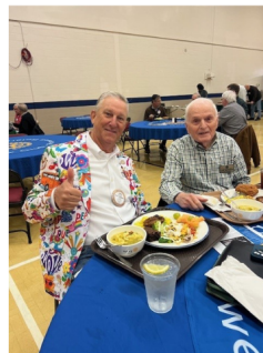
Closed Out our Roswell Rotary Through the Decades Series