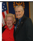
Barbara M. and Donald L. Thomas Peace Award