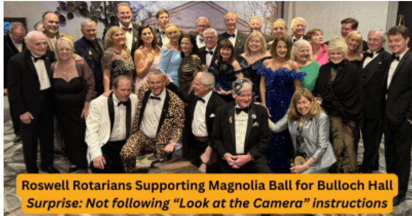
Roswell Rotarians Supporting Magnolia Ball for Bulloch Hall Surprise: Not following "Look at the Camera" instructions

Be there! Special Memorial Day Program meeting Thursday, May 21