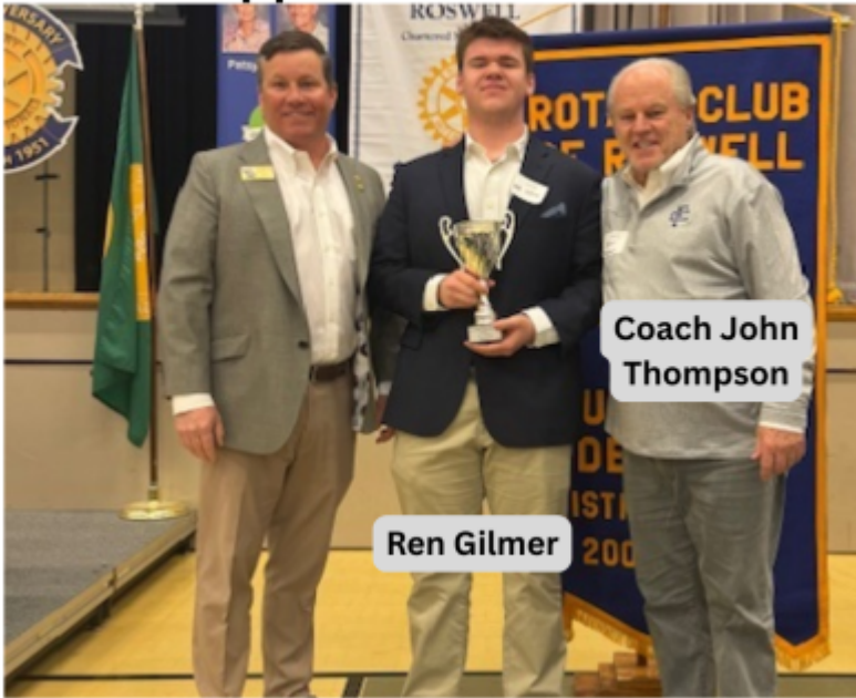
Coach John Thompson