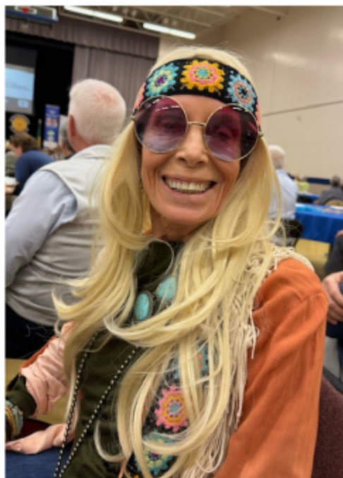
Roswell High School Skipper Hoke Award