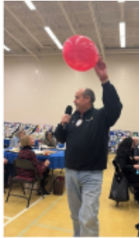
We Caught the Vibe!