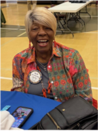
Joy at Rotary