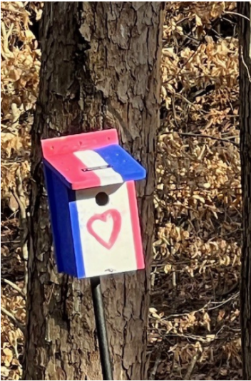
Bluebirds are starting to nest in the bird houses we built at Farm Day!